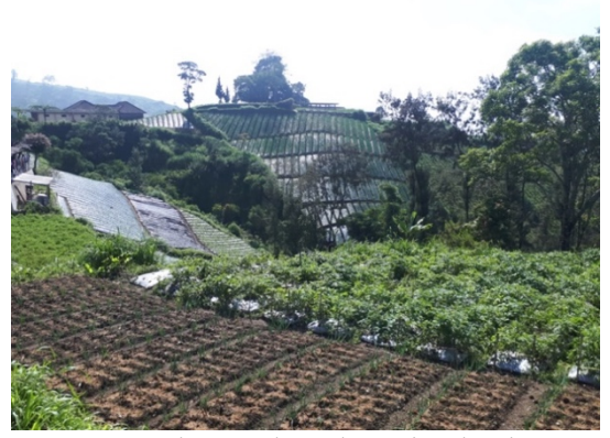
Figure 6. Selo people's plantation land

The Sadranan tradition is carried out before the arrival of the holy month of Ramadan. Selo residents bring various foods that are placed in containers made of woven and filled with various types of dishes brought from home. Generally, residents bring food in the form of cakes and even some vegetables harvested from the fields. This tradition is followed by almost all residents of Selo Village, especially the men. The essence of the Sadranan tradition is to pray for God's forgiveness and to pray for the family who has passed away.