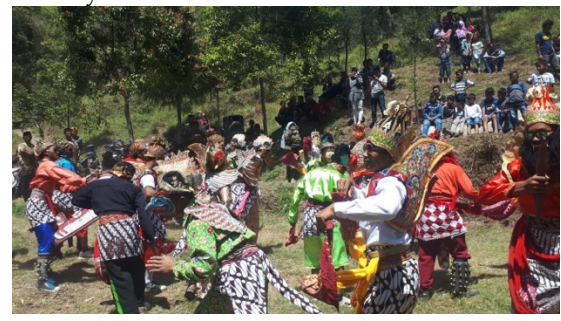
Figure 3 . Citizens' Involvement in the Implementation of the Tuk Babon Ritual

At the Tuk Babon Ritual ceremony, local children, most of whom were in the elementary school age range, were involved in a series of local customs, among them, the Gunungan Kirab Ceremony which was an event to bring the harvest around the village together. They followed the Gunungan Kirab towards the foot of Mount Merbabu to proceed to the Tuk Babon ritual. There they not only witnessed the rituals that took place but also brought in the harvests formed by the mountains. The study of environmental resources can encourage students to improve their ecological literacy [26]. Simple changes, such as providing information that is simple to understand, can promote ecological literacy.