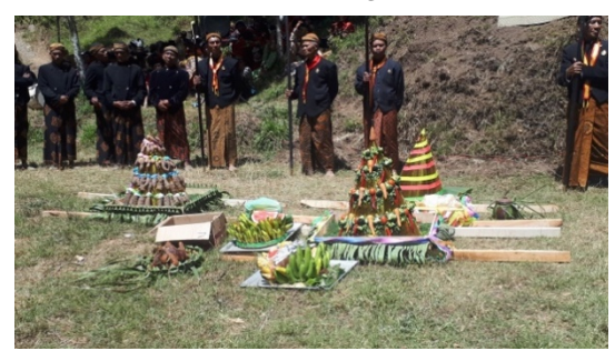
Figure 2 . Gunungan of Harvest Results of Selo Residents who are around the village

community carried out a mountain charity ceremony. Salvation is an environmental activity that aims to pray together for safety and abundant yields [22]. The process carried out in alms mountain is as follows: the villagers carry 1 large cone, 1 corn rice cone, 7 trays of pulses, and heirlooms (kris, spears, swords, samurai) are taken to Turonggo Seto hermitage. Then the heirloom was poured with flower water and then went to Petilasan Kebo Kanigoro. Next is the unification of the holy water in Petilasan Kebo Kanigoro. The Alms Mountain Tradition comes from the story of tripe base Mbah Petruk that gives fields to local residents, who previously did not yet exist [23]. Unified holy water is taken from the slopes of Merbabu mountain with Perwitasari water on the slopes of Merapi, then placed in a water container to be used by residents who offer offerings.