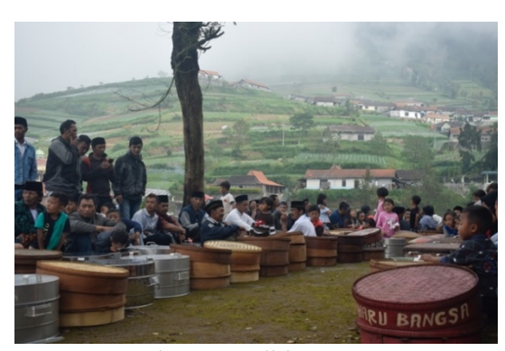
Figure 5. Sadranan tradition

Selo Village has 4 domains that can be developed in designing destination branding strategies. The four domains are, religious, tourism, culture, and society. These four things become a strong potential in presenting an image to tourists as well as being a differentiator from other tourist villages. Through mind mapping analysis in terms of culture, tourism, religion and society, the concept of destination branding design can be determined. From these four things, a "Balanced" concept is obtained. This concept is a combination of the potential that exists in Selo Village.