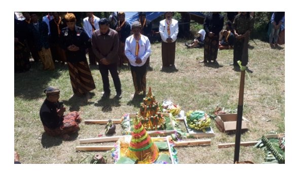
Figure 1 . Prayer Readings on the Tuk Babon Ritual Represented by Four Great Religion as a Form of Multiculturalis

Then the opening and reading of prayers from representatives of four major religions in Indonesia were carried out. This is the meaning of unity in the diversity of Indonesia's multicultural society. People who are environmentally literate have the knowledge and skills to understand environmental problems, which would allow them to act in an environmentally friendly way.