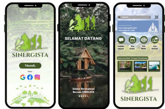
Figure 3. Illustration of the SINERGISTA Application

Aplikasi Sinergista (Sinergi The Sinergista (Synergy Agrotourism) application is an Android-based virtual tourism platform designed not only as a medium for collaboration among stakeholders (Pentahelix Connectors) in agrotourism, but also as a promotional tool to showcase and highlight the beauty of tourism destinations across Indonesia.