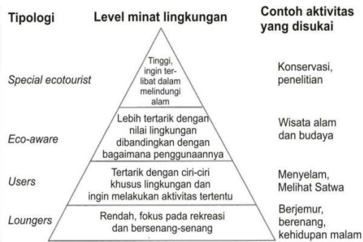
Figure 4. Types of Tourists Based on Environmental Interests

Sinergista integrates Augmented Reality (AR) technology to enhance the visual experience of the application, enabling a more optimal introduction to agrotourism areas. Several key features of the application include: