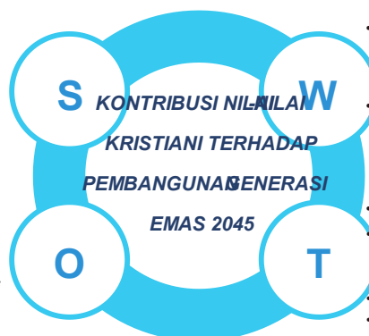
Figure 3. SWOT Analysis of the Contribution of Christian Values to the Development of the Golden Generation 2045

This figure summarizes how Christian values contribute to shaping the 2045 Golden Generation by identifying internal strengths and